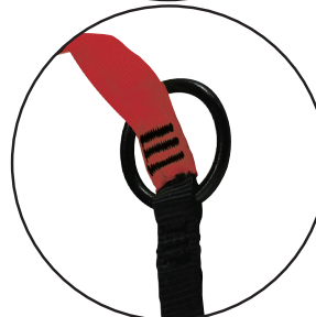
50mm 'O' Ring