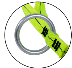
Choke loop & 50mm 'O' ring