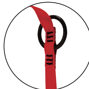
50mm 'O' Ring